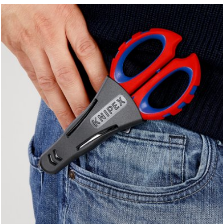
Securely stowed and always at hand